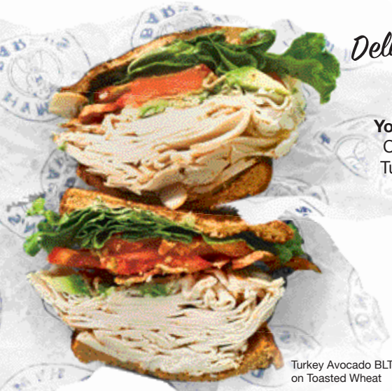
Turkey Avocado BLT on Toasted Wheat