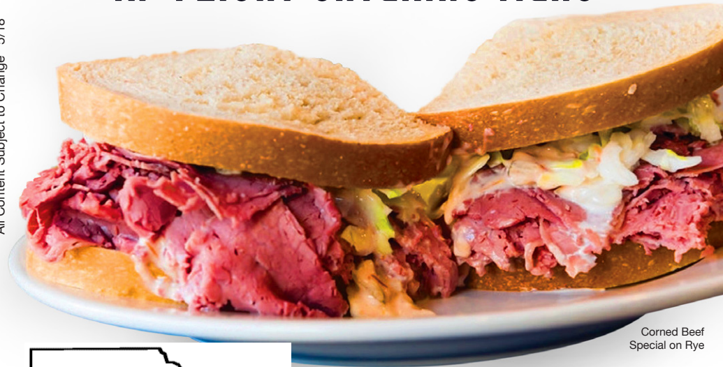
Corned Beef Special on Rye