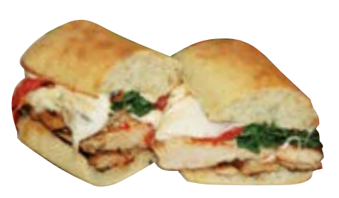
(5-10 minutes to cook)